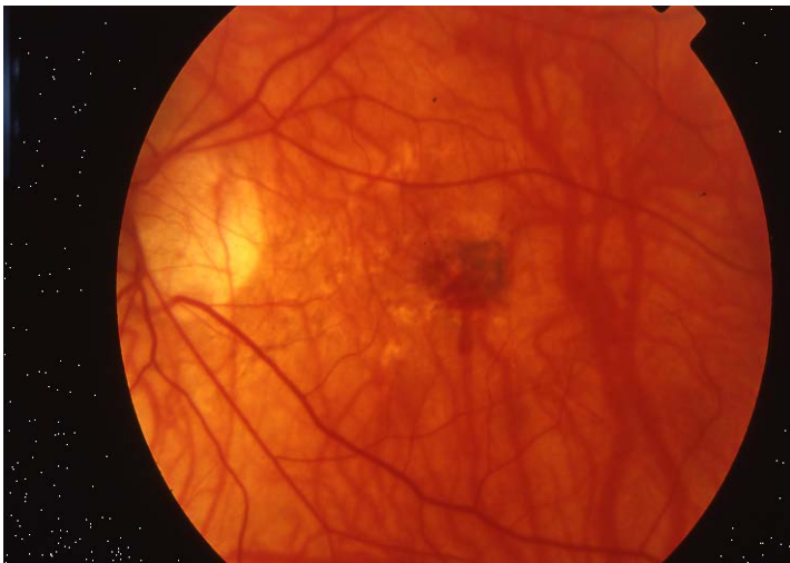
Retina with Pathologic Myopia